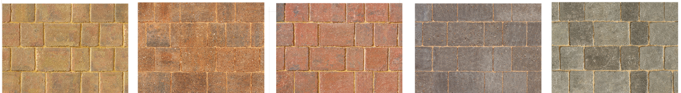
Autumn Gold (AG)